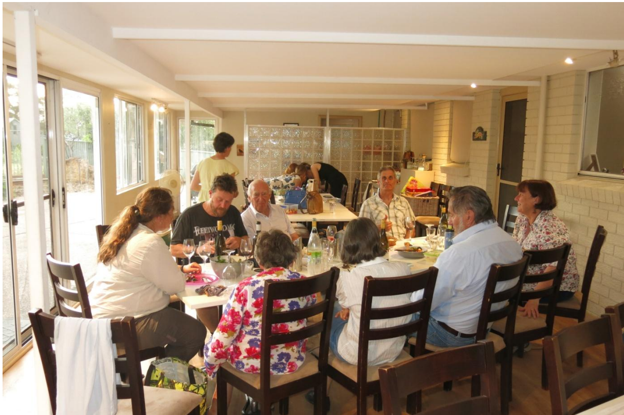
OFNCS/ECCO Xmas Party at Orange Mountain Winery

Note: concession rate is for bona fide pensioners and students only